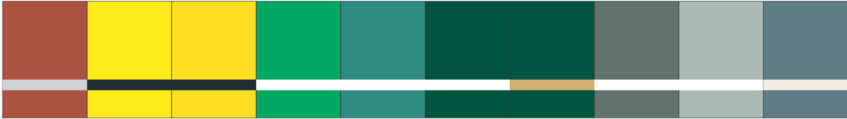
3XX-823 Canyon/Cement 3XX-704 Yellow/Black 3XX-794 Safety Yellow/Black 3XX-932 Bright Green/White 3XX-972 Celadon Green/White 3XX-992 Hunter Green/White 3XX-997 Hunter Green/Gold 3XX-902 Black Forest Green/White 3XX-312 Sea Grey/White 3XX-942 Balsam/Ash