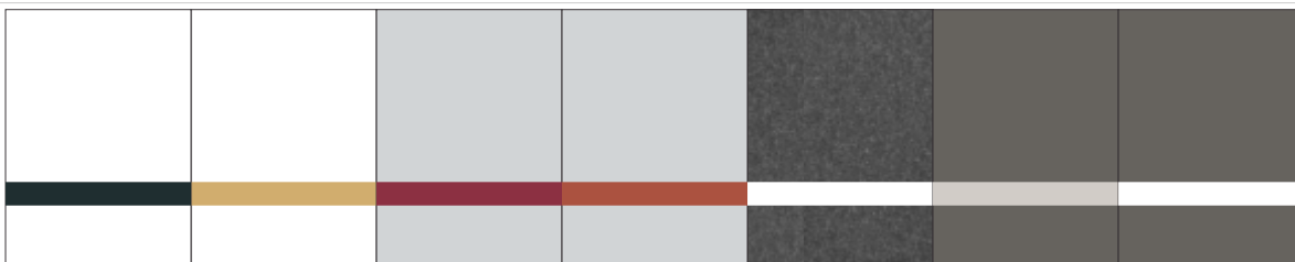
3XX-204 White/Black 3XX-217 White/Gold 3XX-236 Cement/Garnet 3XX-238 Cement/Canyon 3XX-392 Graphite/White 3XX-413 Cinder/Clay 3XX-432 Cinder/White