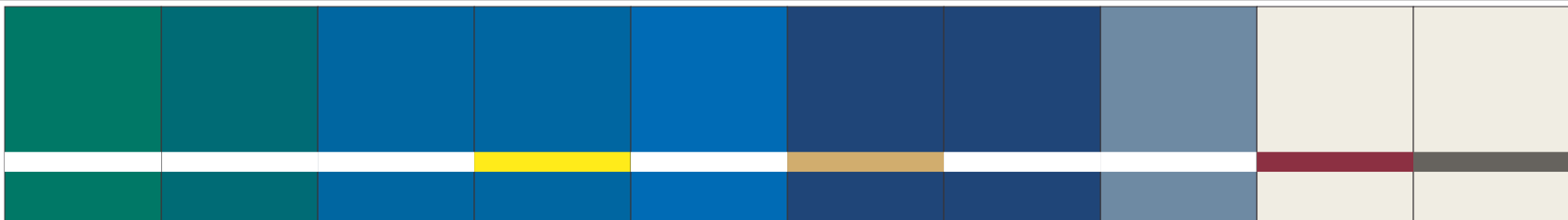
3XX-962 Teal/White 3XX-592 Ocean Blue/White 3XX-512 Blue/White 3XX-517 Blue/Yellow 3XX-562 Sapphire/White 3XX-527 Blueberry/Gold 3XX-542 Blueberry/White 3XX-382 China Blue/White 3XX-246 Ash/Garnet 3XX-244 Ash/Cinder