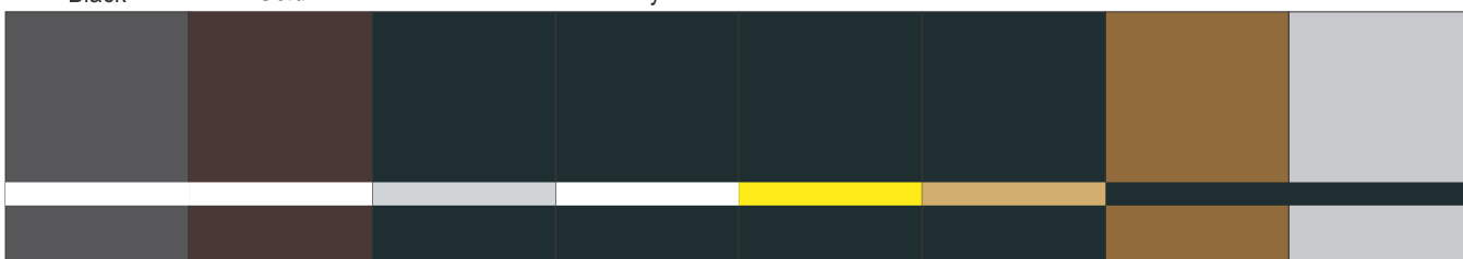
3XX-302 Charcoal Grey/White 3XX-842 Dark Brown/White 3XX-423 Black/Silver 3XX-402 Black/White 3XX-407 Black/Yellow 3XX-417 Black/Gold 3XX-774 Vintage Gold/Black 3XX-384 Vintage Silver/Black