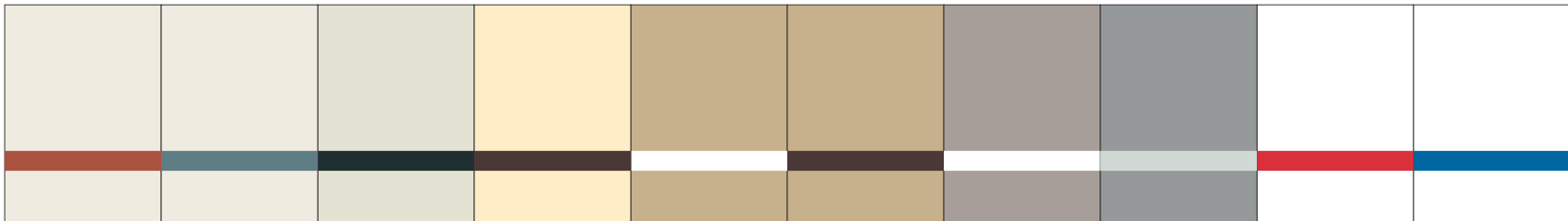
3XX-218 Sandalwood/Canyon 3XX-219 Sandalwood/Balsam 3XX-814 Parchment/Black 3XX-228 Ivory/Dark Brown 3XX-832 Beige/White 3XX-838 Beige/Dark Brown 3XX-802 Taupe/White 3XX-595 Driftwood/Alpine 3XX-206 White/Red 3XX-205 White/Blue