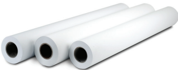
HP Prime Gloss Air GP For the latest ICC profiles/paper presets, please visit www.printos.com